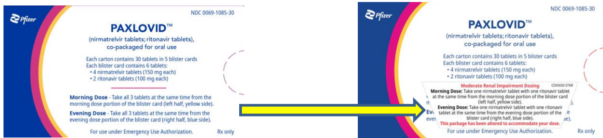
Figure 3: Placement of sticker over pre-printed dosing regimen on carton

STEP FOUR: Affix one sticker from the provided tear pad to carefully cover over the pre-printed dosing regimen on the carton as shown in figure 3 below: