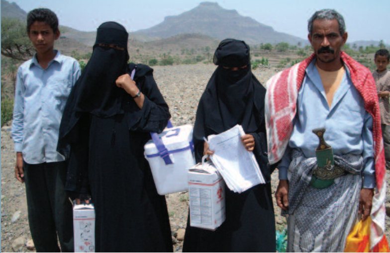
Jos Vandelaer, Courtesy of Photoshare

in how to solve problems as they arise, for example, how to record doses correctly during the circumstances of the intensified activity.