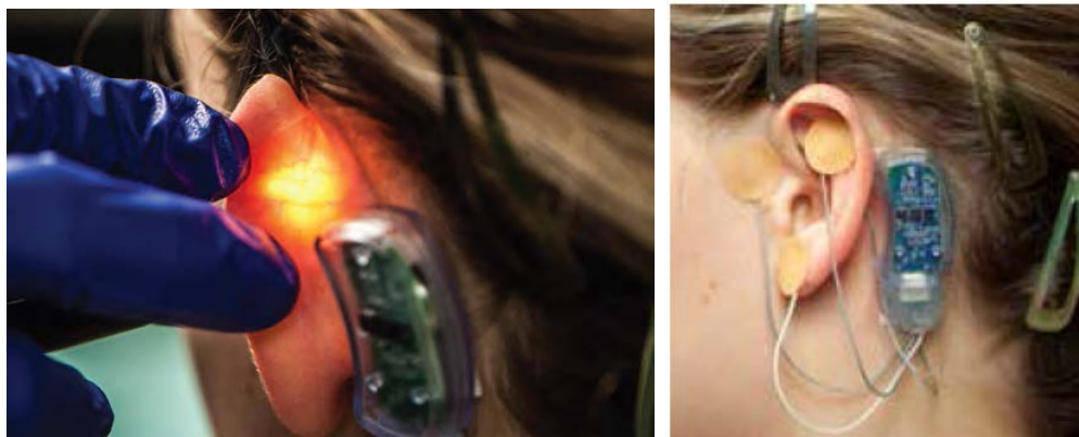
Figure 1: (Left) Visualization of neurovasculature of the ear using transillumination technique. (Right) Representative image of the placement of the IB-Stim device.

The wire harness percutaneous electrode array consists of 4 leads. The 1-1-1-4 configuration consists of three single-needle leads, and one 4-needle array (Figure 2).