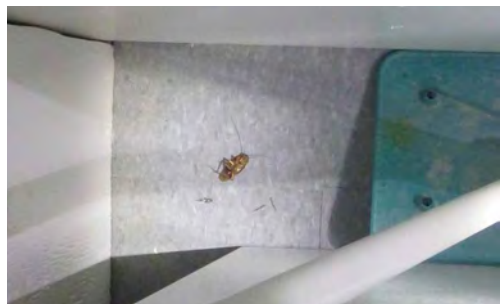
Dead cockroach on the floor of a compounding room.