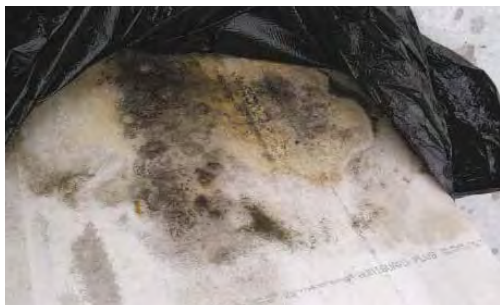
Visible mold contamination on ceiling tiles removed from room where compounding occurred.