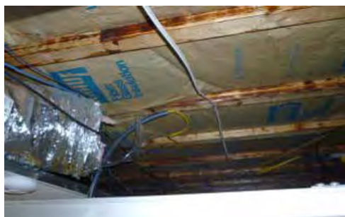
Exposed insulation in ceiling above doorway to a cleanroom.