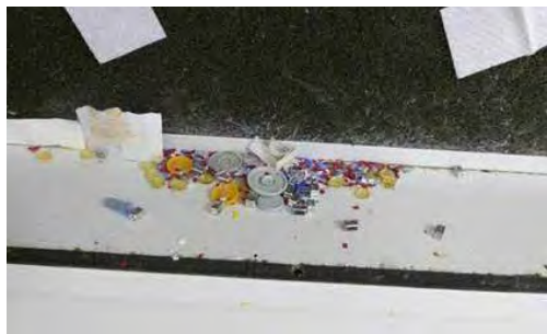
Medical supply waste and dust built up in the pre-filter of an ISO-5 hood where drugs were compounded.

Photos of insanitary conditions taken during FDA inspections of drug compounders. Insanitary conditions can cause drugs to become contaminated and lead to serious patient injury or death.