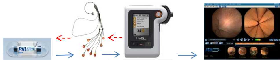
Figure 3: Data flow of Given PillCam endoscopy system

The PillCam COLON 2 capsule endoscopy system acquires video images of the colon during natural propulsion through the digestive system. Figure 3 illustrates the data flow from the PillCam COLON 2 capsule through the antennas of the Sensor Array and PillCam Recorder to the workstation that utilizes the RAPID software to output an image of the colon.