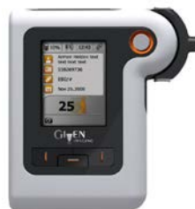
Figure 2: DR 3 PillCam Recorder