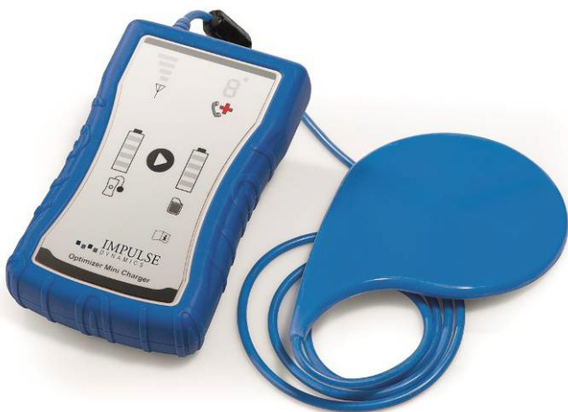
Figure 2: OPTIMIZER Mini Charger

The OPTIMIZER Mini Charger is also powered by a rechargeable battery. The charging wand is permanently attached to the device with a cable long enough to let you set up the charger up to almost 20 in away from you. The charging process runs automatically without requiring significant user intervention. Please refer to Section 7 of this manual for details on the proper operation of the charger.