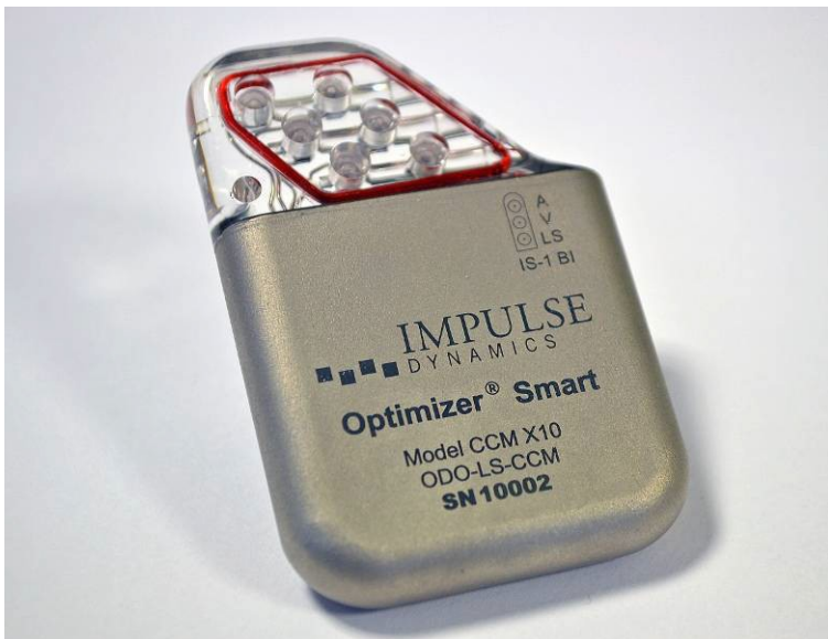
Figure 1: OPTIMIZER Smart IPG

The expected life of the OPTIMIZER Smart IPG is limited by the expected service life of its rechargeable battery. The rechargeable battery inside the OPTIMIZER Smart IPG should provide at least six years of service. Over time and with repeated charging, the battery in the OPTIMIZER Smart IPG will lose its ability to recover its full charge capacity.