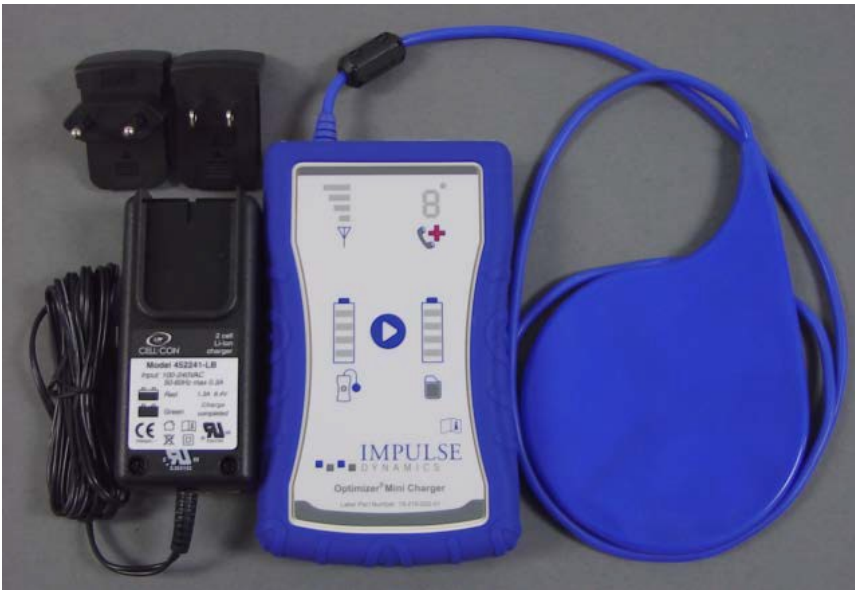
Figure 3: OPTIMIZER Mini Charger with Battery Charger and Plug Adapters