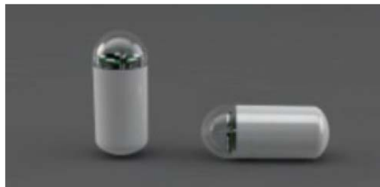
Figure 3-2: NaviCam Stomach Capsule

The NaviCam Stomach Capsule (AKEM-11SW) is an ingestible imaging device having an outer diameter of 12 mm and a total length of 28 mm. See image of the capsule below.