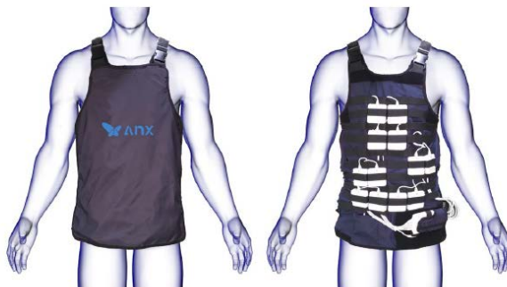
Figure 3-4: NaviCam Data Recorder in Examination Vest