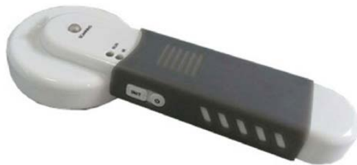
Figure 3-7: NaviCam Locator

The locator (AKS-1) is a portable magnetic scanning device powered by a built-in rechargeable lithium battery. It is used to detect whether the capsule is inside the human body and probe its approximate position. Also, it is used to turn on the capsule before the patient ingests the capsule. See image of the locator below.