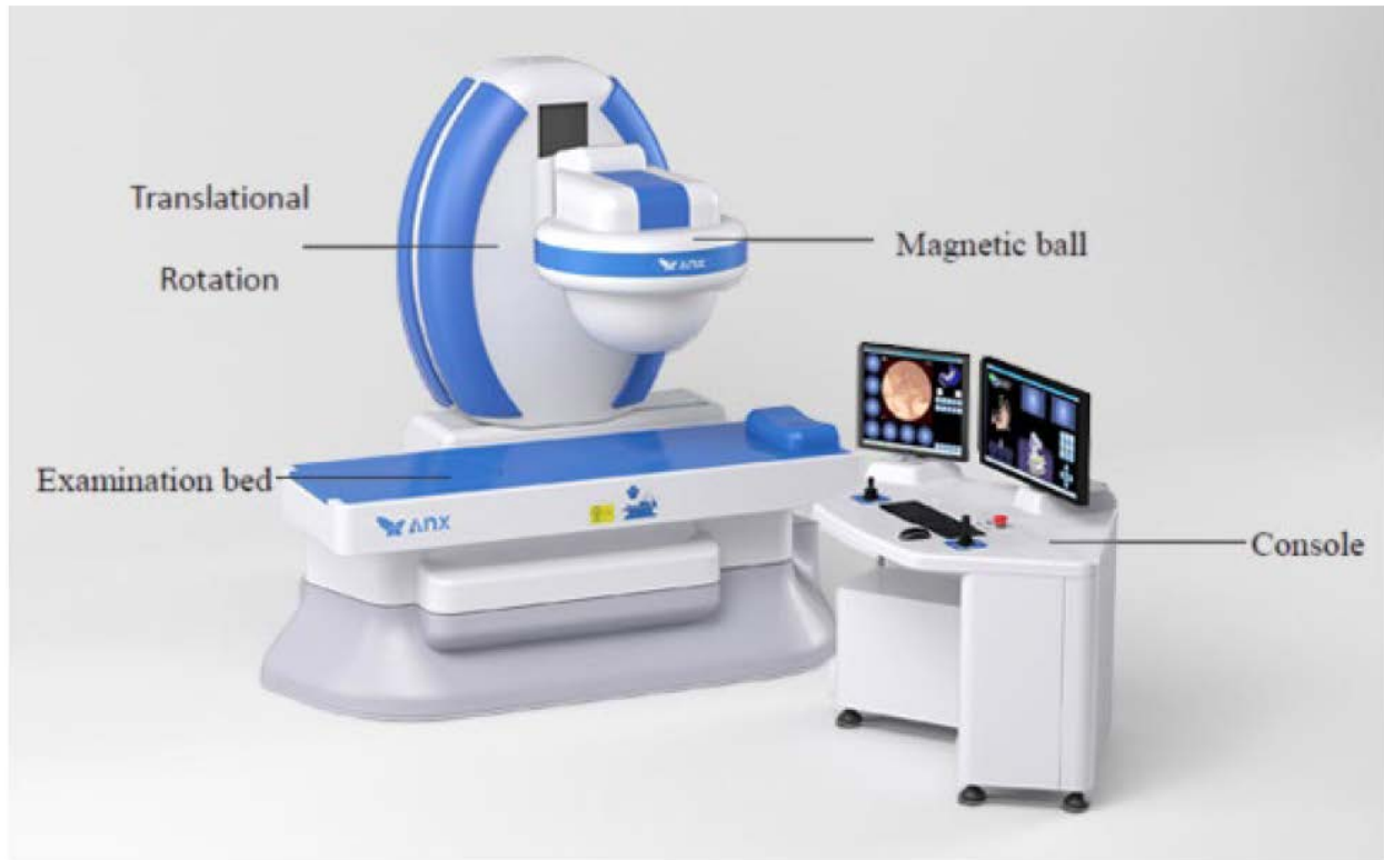
Figure 3-5: NaviCam Controller