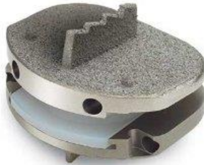
Figure 1: prodisc® L Device

prodisc® L’s superior and inferior endplates are manufactured of Co-28Cr-6Mo (CoCrMo) per ISO 5832-12. The surfaces of both the inferior and superior endplates are plasma sprayed with commercially pure titanium (CpTi) conforming to ISO/DIS 5832-2 (1999) “Implants for surgery”. The fixation of the implant to the vertebral bodies is intended to be achieved through bone ongrowth, with initial stabilization by a keel and two small spikes on the surface of the two endplates. The inlays are manufactured from UHMWPE. For identification of the position of the UHMWPE-inlay under x-ray-control, they include a tantalum x-ray marker per ISO 13782. The inlay snap-locks into the inferior plate and provides the inferior convex bearing surface that articulates with the concave bearing surface of the superior plate.