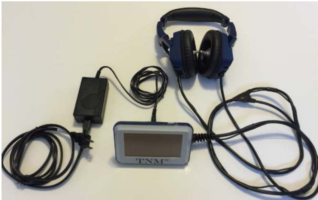
Figure 1: ThermoNeuroModulation Device Components

The TNM Device is a non-invasive, home-use, DC-powered medical device that consists of an over-the-ear Headset with earpieces that protrude into the external ear canals, a Control Unit with resistive touchscreen display, and a power cord. Optional accessories include a wedge pillow to support reclining during each treatment in place of a firm pillow, a stylus pen that can be used in place of a fingertip to interact with the display and prism spectacles that may be worn to enable reading and other visual relaxation activities during treatment.