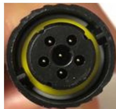
Figure 2 – Front view of Power Source Connectors

Below is a summary of the changes to the cleaning instructions for the Controller AC Adapter, DC Adapter, and Battery: