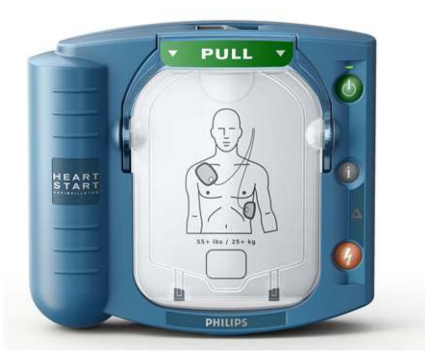
Figure 1: HeartStart OnSite and Home AED

Figure 1 shows an image of the Home and OnSite AEDs (which are the same device but for use in different settings). The AED features are identified in Figure 2.