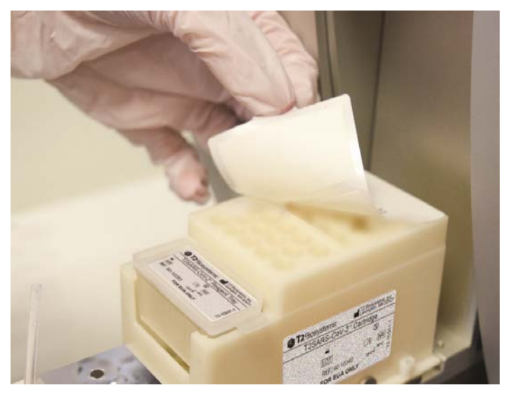
Figure 3. Remove top seal.

29. Hold the Panel with one hand for stability and remove the plastic Reagent Tray cover without touching the foil seal or any of the exposed Cartridge components (Figure 4).