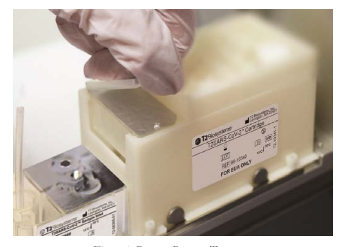
Figure 4. Remove Reagent Tray cover

29. Hold the Panel with one hand for stability and remove the plastic Reagent Tray cover without touching the foil seal or any of the exposed Cartridge components (Figure 4).