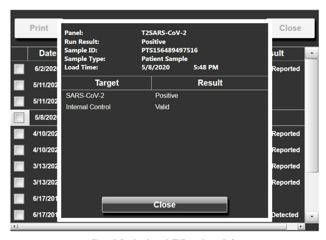
Figure 7b. Panel results via the T2Dx touchscreen display

Messages and error codes may be generated by the T2Dx during the performance of the Panel. The operator must check the results printout to verify the Panel result is valid.