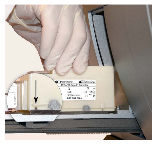
Figure 2. Panel should be level and seated on location pins.

28. When prompted to "Tear off Label," hold the Panel with one hand for stability and remove the top seal from the Cartridge by gently pulling back on the label tab (Figure 3).