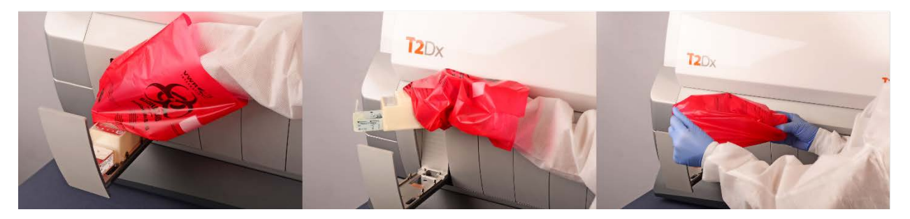
Figure 6. Proper Technique for Unloading the T2SARS-CoV-2 Panel.

NOTE: Be careful when removing the used Panel to avoid spilling of reagents, samples, and disposables. Do not tip or invert the used Panel. Ensure that the Panel remains upright while unloading.