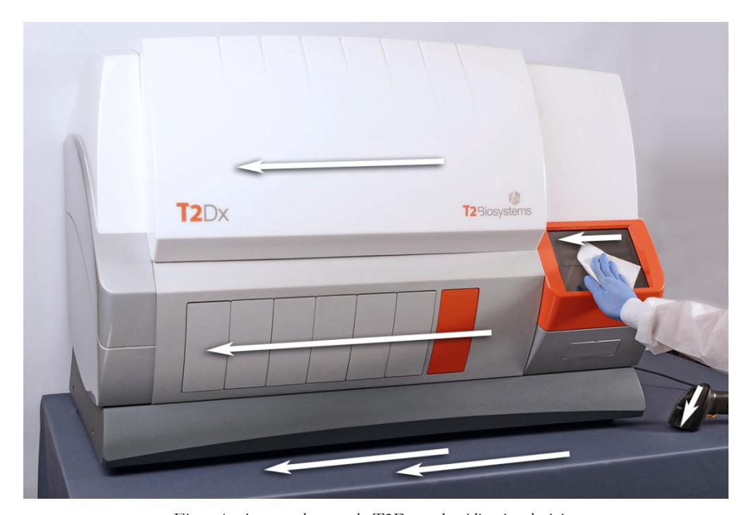
Figure 1. Areas to clean on the T2Dx and unidirectional wiping.