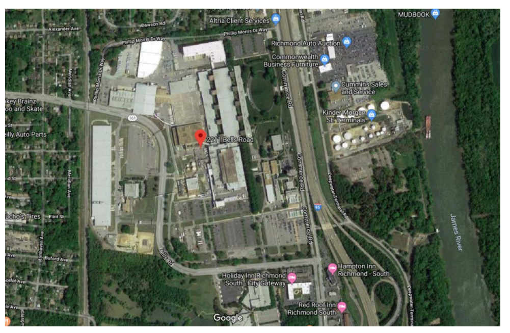
Figure 1. Location of the Manufacturing Facility

The new product would be manufactured at the address listed in section 1 of this document (Figure 1) and the subcontracted manufacturing facility (Confidential Appendix 1).