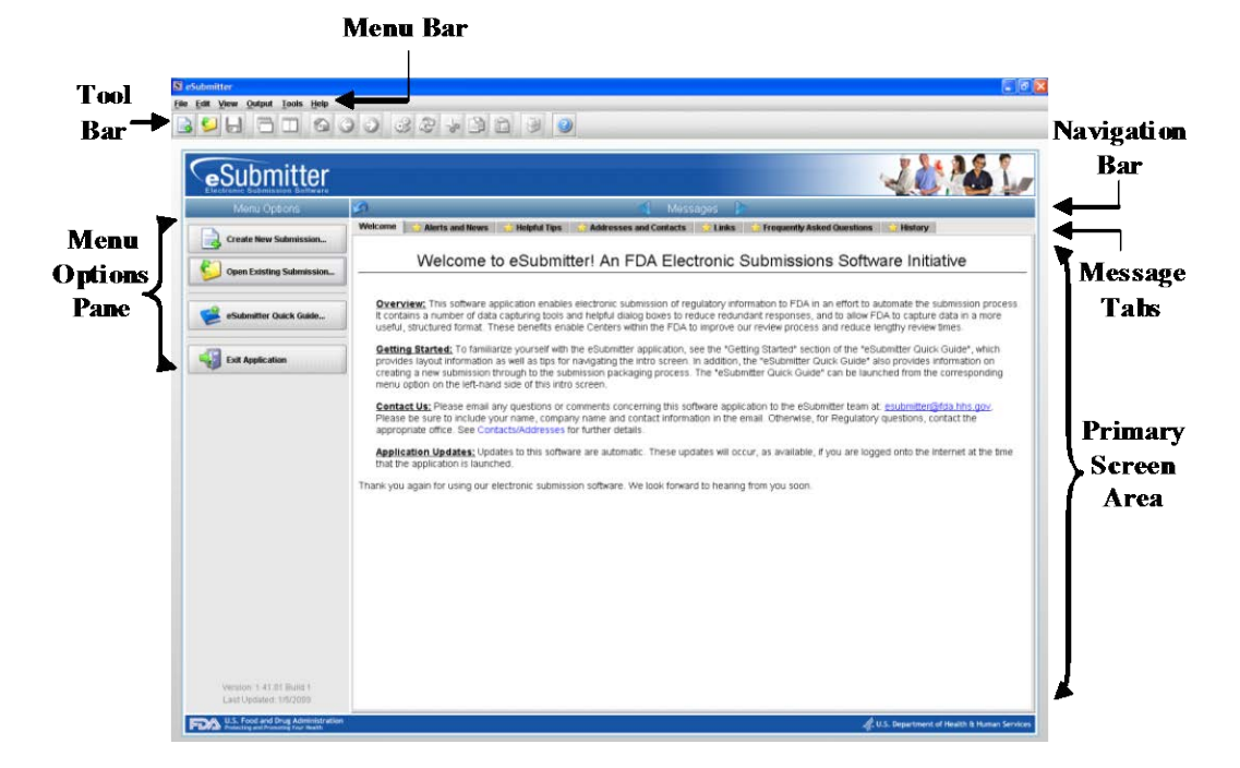
Figure 2: eSubmitter Welcome Screen Page

To uninstall the previous versions of the FDA eSubmitter Tool, use Windows Explorer to navigate to the eSub folder of the installed drive (e.g., C:). Then, double-click on the uninstall.exe and follow the instructions provided. (If you do not see uninstall.exe, locate and double-click to open the JExpress file folder. Then, double-click on the uninstall.bat and follow the instructions provided.)