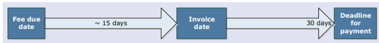
Figure 1. Procedure for fee determination and payment

The following definitions shall apply for the determination of fees for scientific advice requests: