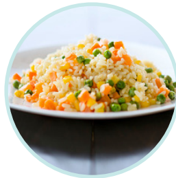
Rice, pasta, and other grain dishes