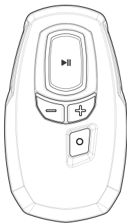
Figure 3. Sleep remote

After you have healed from the surgical procedure, your doctor will adjust your therapy settings so your sleep apnea is treated effectively. You will receive your sleep remote (Figure 3), which allows you to turn therapy on and off. You will also be able to adjust the stimulation strength within a range determined by your doctor.