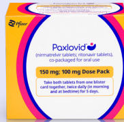
Reduced Dose for Patients With Moderate Renal Impairment