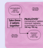
Reduced Dose for Patients With Moderate Renal Impairment