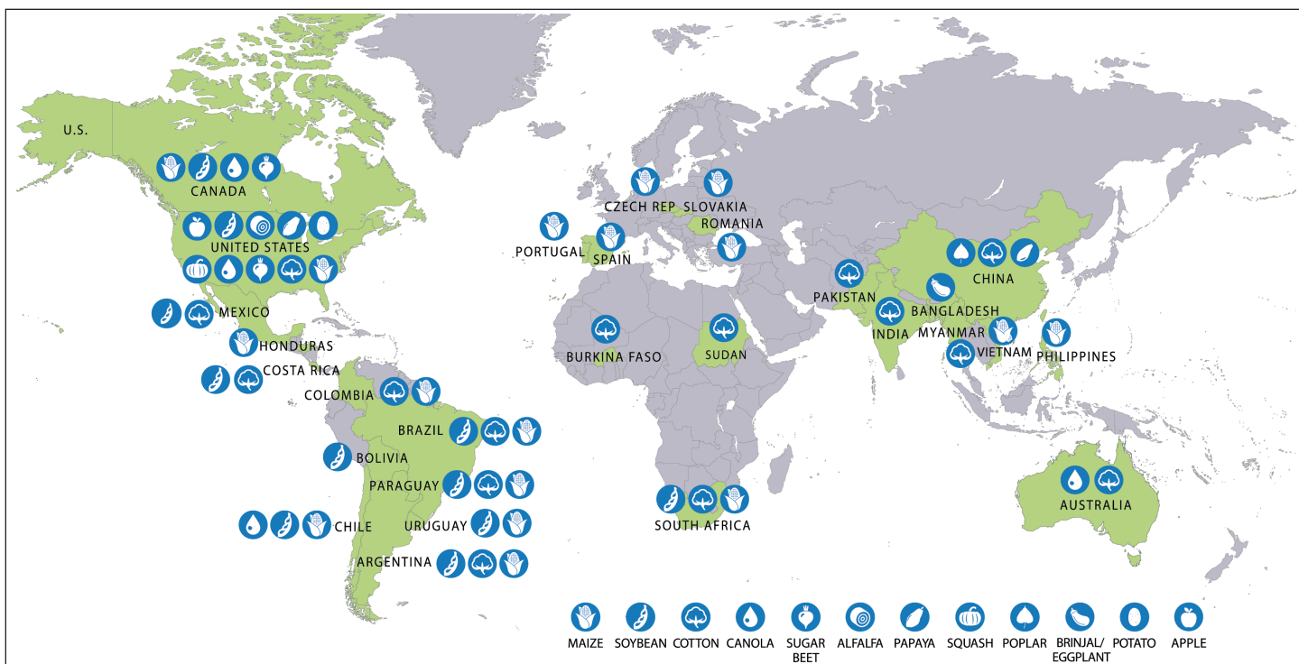
FIGURE 1. Commercially Grown GE Crops Worldwide. In 2015, almost 180 million hectares of GE crops were planted globally, which was about 12 percent of the world's planted cropland that year. There were herbicide-resistant varieties of maize, soybean, cotton, canola, sugar beet, and alfalfa, and insect-resistant varieties of maize, cotton, poplar, and eggplant.

insects that ingest them. Following are conclusions about various effects of Bt crops based on available data: