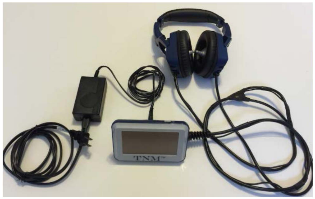
Figure 1: ThermoNeuroModulation Device Components

The TNM Device is a non-invasive, home-use, DC-powered medical device that consists of an over-the-ear Headset with earpieces that protrude into the external ear canals, a Control Unit with resistive touchscreen display, and a power cord. Optional accessories include a wedge pillow to support reclining during each treatment in place of a firm pillow, a stylus pen that can be used in place of a fingertip to interact with the display and prism spectacles that may be worn to enable reading and other visual relaxation activities during treatment.