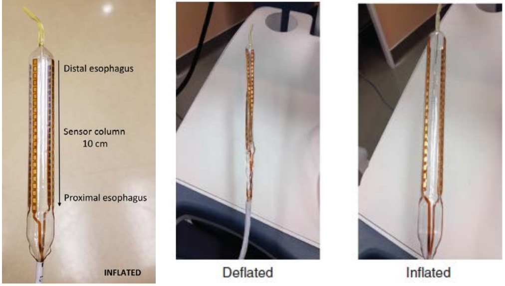
Figure 1. Inflated and Deflated Probe.

The patient undergoing an esophageal mucosal impedance study will first have an endoscope placed with the distal end of the scope proximal to the area under study. The MI Probe is advanced into the patient's esophagus by guiding it alongside the endoscope. The MI Probe is positioned under visual guidance using the optics of the endoscope. The probe also contains proximal markings on the catheter portion outside the patient to aid in positioning. The total time of deployment for collecting mucosal impedance values is expected to be less than 5 minutes. Figure 1 shows the MI Probe and its components along with its inflated and deflated state.