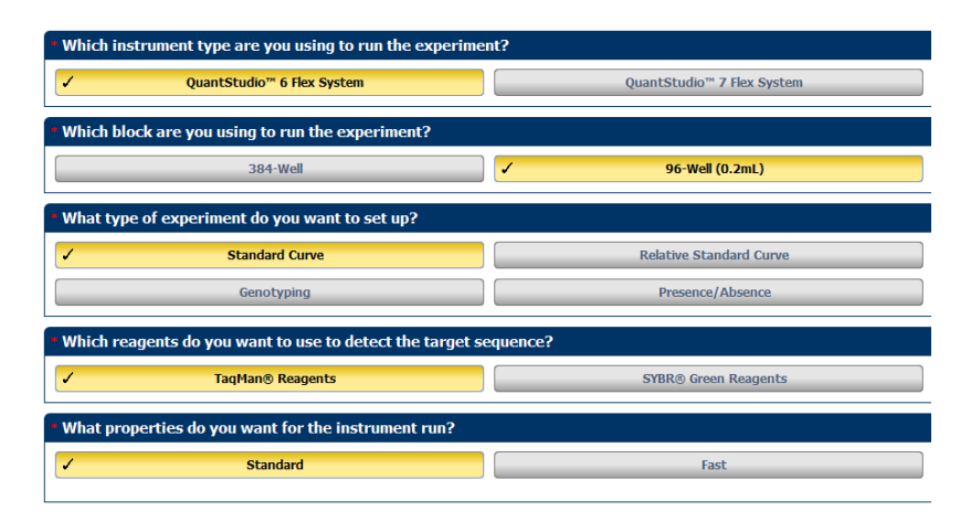
Figure 2. Experiment Properties set-up