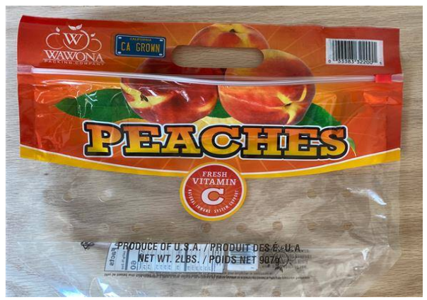
Pictured: Wawona Peaches 2 lb.

ALDI takes the safety and integrity of the products it sells seriously. If customers have product affected by this voluntary recall, they should discard it immediately or return it to their local store for a full refund.