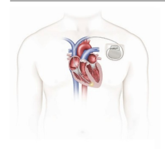
Figure 2. Traditional pacemaker implant

The following figures illustrate difference in the implant location of the leadless pacemaker compared with a traditional pacemaker.