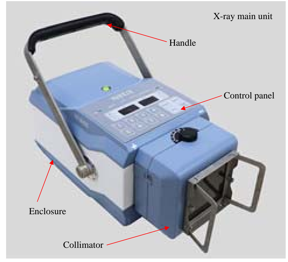
Fig.1 SR-8230 Portable X-ray Unit