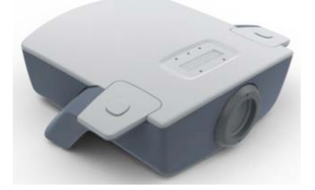
Figure 1: The Pediatric Vision Scanner Device

The Pediatric Vision Scanner (PVS) is a non-invasive, optical instrument intended to be used for ophthalmic diagnostic purposes. The device integrates all hardware components within the plastic enclosure, including the image acquisition optics, the system computer, and visual display.