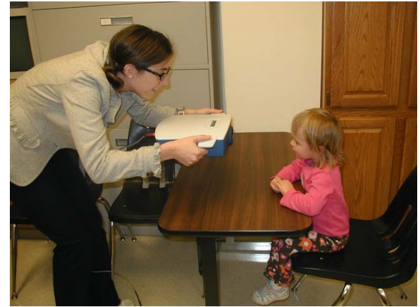
Figure 2: Positioning of the Device

Prior to each measurement, a background measurement is obtained to minimize signal interference. Rangefinders (laser diode, 650 nm wavelength) allow the proper positioning of the device (~ 0.5 meters) during background measurement and measurement as shown in Figure 3.