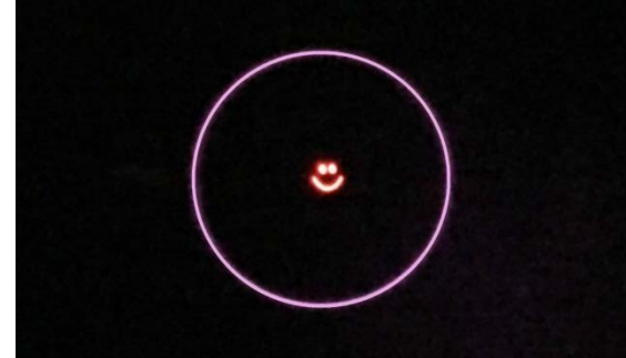
Figure 4: Fixation Target Inside the Aperture

The operator performs the measurement; a spot of near-infrared (laser diode, 830 nm wavelength), polarized light rotates circularly around the fixation target.