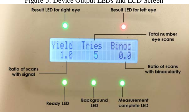
Figure 5: Device Output LEDs and LCD Screen

The device has an optical portion and integrated software analysis to administer, interpret, and convey the results of a scan.