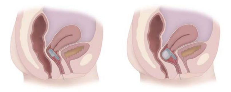
Figure 1. Eclipse Insert; balloon deflated (left) and inflated (right)

is used intra-vaginally, is insertable/removable by the patient, and includes a balloon that when inflated, exerts a force posteriorly (trans-vaginally) against the wall in the rectum resulting in a decrease in the lumen of the rectum (Figure 1). The compression of the rectal space results in decreased frequency of fecal incontinence events. The Eclipse Insert consists primarily of a silicone and stainless steel base with an inflatable silicone balloon. The pump is used by the patient for inflating and deflating the balloon with a goal of improving control over bowel movements.