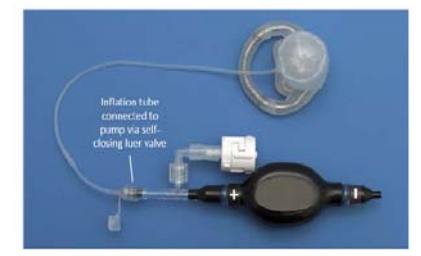
Figure 3a. Patient Pump.