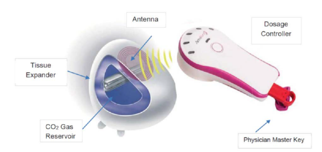
Figure 1: Image of AeroForm Tissue Expander System

The AeroForm® Tissue Expander System is comprised of the AeroForm Tissue Expander, the Dosage Controller, and the Physician Master Key (see Figure 1). Each system component is further explained in subsections below.