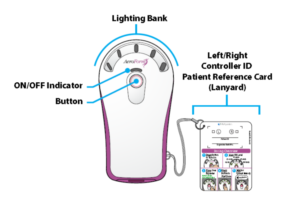
Figure 2: Schematic of Dosage Controller

The Dosage Controller is a small, hand held battery-powered, non-sterile device. It activates the AeroForm Tissue Expander to release the programmed amount of CO<sub>2</sub> gas (10cc). The Dosage Controller is configured to provide coded instructions to its bonded AeroForm Tissue Expander. It has a single push button for ease of use and a bank of indicator lights (LEDs) and tones. The LEDs are bi-color, with amber and green lights, where green indicates successful communication and dosing and amber indicates a notification regarding communication, dosing or power down. Each dose administers 10cc of CO<sub>2</sub>. There is a patient dosing limit of 3 (10cc) doses per day and a 3 hour time period between doses. A closer view of the Dosage Controller is provided in Figure 2 below.