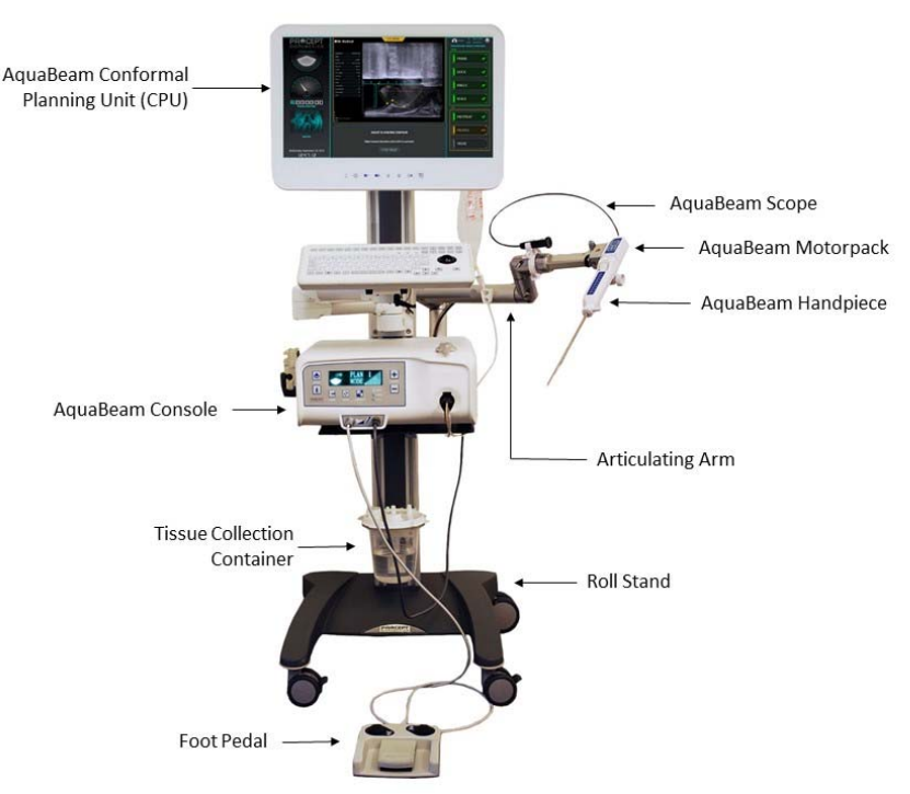
Figure 1 AQUABEAM System