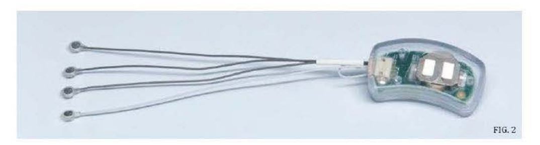
Figure 2: PENFS System

The stimulator is placed behind the ear and the percutaneous electrodes are positioned utilizing the transillumination function of the device (Figure 1). The transillumination technique assists in the visualization of the vasculature of the ear to aid in the placement of the percutaneous electrodes near the nerve branches in the ear. The system specifications are listed in Table 1.