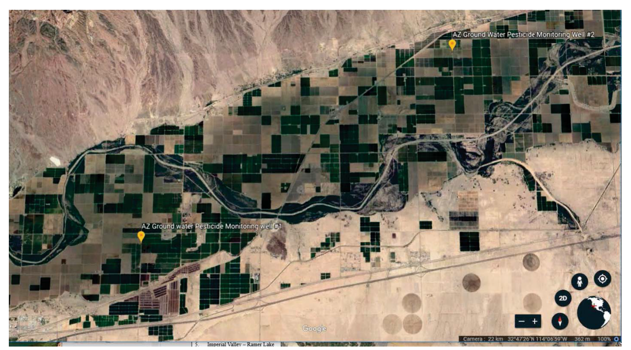
Figure 3. Map of July water sampling locations from State of Arizona ground water pesticide monitoring wells.

In July, water samples were collected from two State of Arizona pesticide ground water monitoring wells (Figure 3), as well as from the salt drainage canal downstream of the WMIDD area of responsibility (Figure 4). E. coli O157:H7 was not detected in either the ground water monitoring wells or the salt drainage canal.