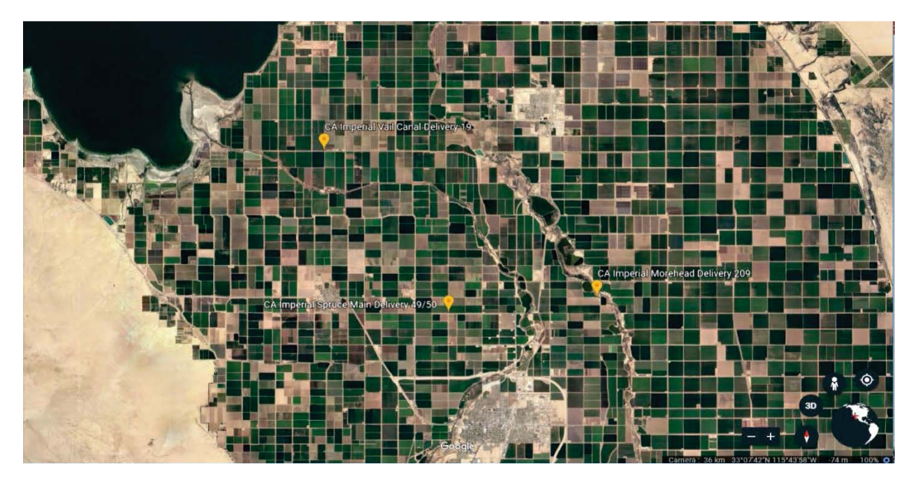
Figure 9. Map of July water sampling locations in CA Imperial Drainage District canals.

In July, the team also collected irrigation water from three Imperial County irrigation canals that provide water to Imperial County farms identified by traceback (Figure 9); all three of these irrigation canals have CAFOs near them. Six strains of E. coli O157:H7, each genetically distinct from each other, were detected at one canal water site (Spruce Main Delivery 49/50) in Imperial Valley, although none match the outbreak strain. (See Table 3.)