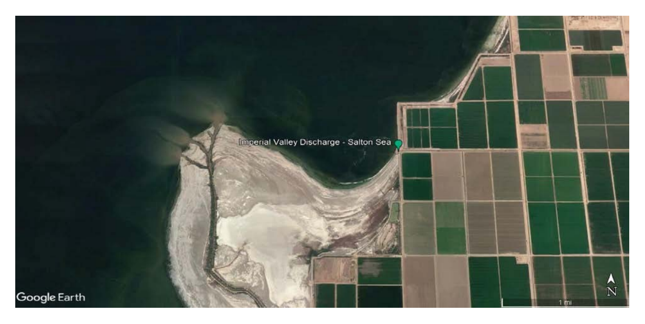
Figure 8. Map of June water sampling location at Imperial Valley drainage canal discharge into Salton Sea.