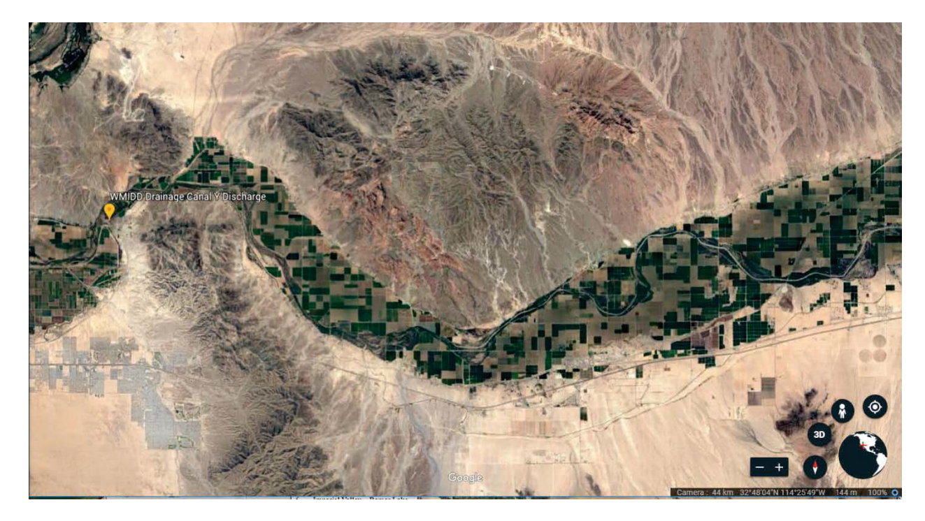
Figure 4. Map of July sampling location in salt water drain canal downstream of the WMIDD area of responsibility.

In August 2018 additional ground and irrigation canal water samples were collected in Yuma County. The sampling sites included the three Wellton irrigation canal sites that tested positive in June 2018 sampling, the irrigation canal before the Wellton-Mohawk canal split, within the Mohawk canal, the termination point of both the Wellton and Mohawk irrigation canals, and the Wellton-Mohawk drainage canal; none of the samples collected in August were positive for the outbreak pathogen.