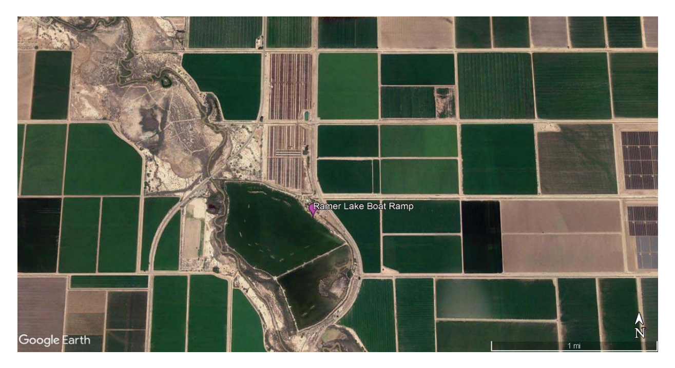
Figure 7. Map of June water sampling location in Imperial Valley at Ramer Lake adjacent to cattle feedlot

In June, the EA team collected samples of surface water from a public pond (Figure 7) immediately adjacent to an Imperial County CAFO near Imperial County farms identified by traceback and from irrigation canal drainage into the Salton Sea (Figure 8). The outbreak strain was not detected.