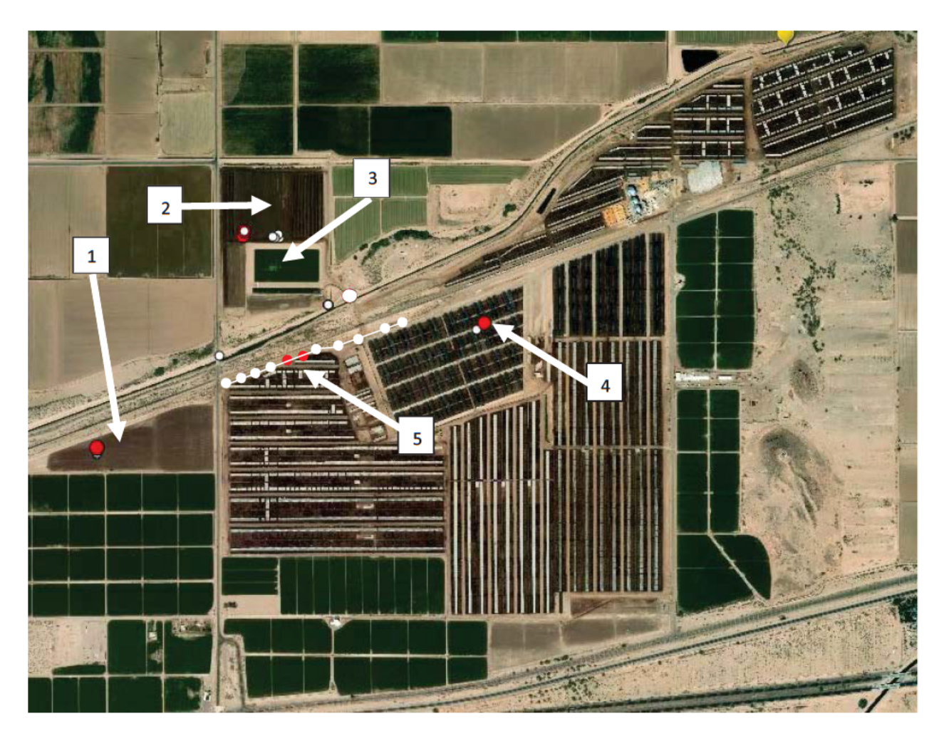
<u>Figure 2.</u> Overview of Wellton area CAFO and adjacent canal property, Including West (1) and North (2) Composting Facilities, North retention pond (3), fresh manure sampling location of steer feeding pens (4), Drag Swabs and soil samples along feedlot perimeter fence-line (5). Circles represent EA team sampling locations (compost and manure). Red circles indicate samples that were positive for STECs. No samples were positive for the outbreak strain.

The EA team collected a total of six samples from the Wellton-area CAFO, consisting of composted manure, dry manure, fresh manure, spilled fresh manure, well water, and feedlot drainage water from the north retention pond. The outbreak strain was not detected in any of these samples. However, the Wellton-area CAFO is a very large facility with a high turnover of steers. This limited sampling was performed after the outbreak had occurred and before the results of the irrigation canal testing were known. Since the sampling was limited, it is not possible to draw statistically valid conclusions regarding the presence or absence of the outbreak strain on this facility based on the number of samples collected and when they were collected relative to the outbreak.