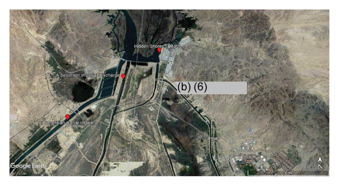
Figure 6. Map of June sampling locations at Imperial Dam and All American and AZ irrigation canals.