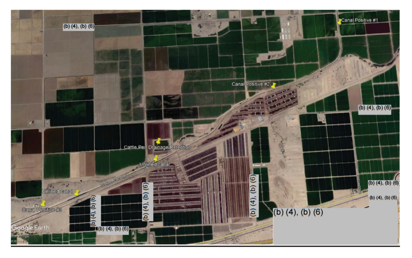
<u>Figure 1.</u> Wellton Irrigation Canal. This Google Earth view depicts a section of the Wellton main canal adjacent to a CAFO and locations of three outbreak-pathogen-positive irrigation water samples. The sample locations are upstream, adjacent to, and downstream of the Wellton-area CAFO. Also noted are unlined irrigation canal sections and a CAFO retention pond. Water in the canal flows from west (left) to east (right) in the figure above. The CAFO at the bottom center of Figure 1. See Figure 2 for an enlarged image of the CAFO.

Through ultrafiltration sampling of irrigation water conducted during the initial site visit in June, E. coli O157:H7 was detected in three places along a 3.5-mile section of the Wellton irrigation canal that is operated by the WMIDD. The locations of the three samples were approximately one mile upstream of a CAFO, adjacent to the CAFO, and approximately one mile downstream of the CAFO (Figure 1). Genetic analyses of these isolates using pulsed field gel electrophoresis (PFGE) and WGS determined that the E. coli O157:H7 found in these three Wellton irrigation canal water samples is the same strain that caused the outbreak. Some of the EA activities described in this report were conducted throughout the Yuma growing region before the EA team was aware of this significant finding. Once the EA team became aware of the positive findings, certain activities were focused on areas around the section of the irrigation canal where these positive water samples were obtained.