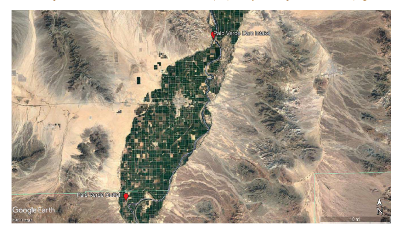
Figure 5. Map of June sampling locations at PV Dam and PV Irrigation Canal discharge into the river.

Water samples were collected from the Palo Verde (PV) valley and Imperial Dam area (Figures 5 & 6).