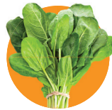
Dark leafy greens