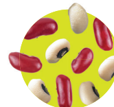
Beans and peas (such as kidney beans and black-eyed peas)

The New Nutrition Facts Label What's in it for you?