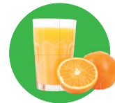
Oranges and orange juice