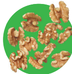
Nuts (such as walnuts)