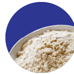
Fortified corn masa flour