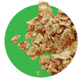
Fortified breakfast cereals