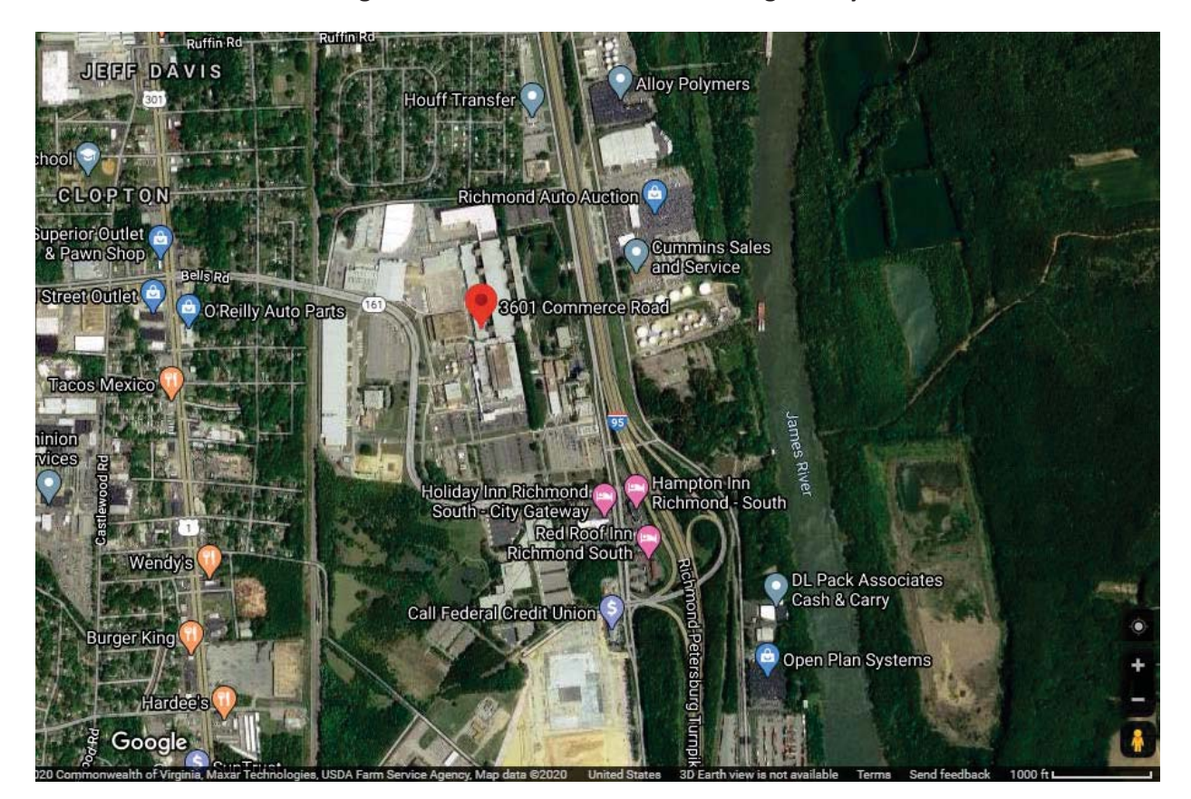
Figure 1. Location of the Manufacturing Facility

The new and predicate products are manufactured at 3601 Commerce Road, Richmond, VA (Figure 1).