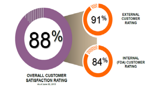
Provide Excellent Customer Service