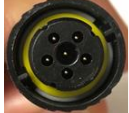
Figure 1 - Side view of Power Source Connectors