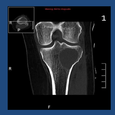
1. Obtain patient geometry