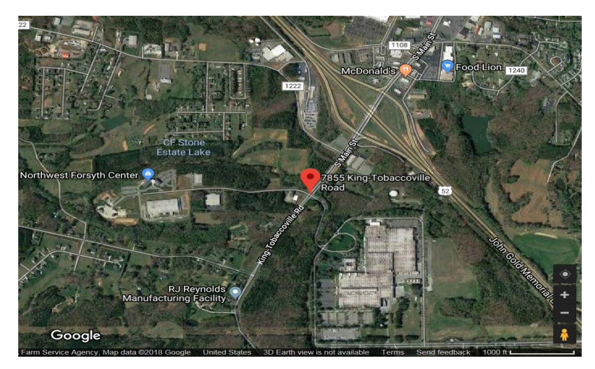
Figure 1. Location of the Manufacturing Facility

The new products would be manufactured at the address listed in section 1 of this document (Figure 1).