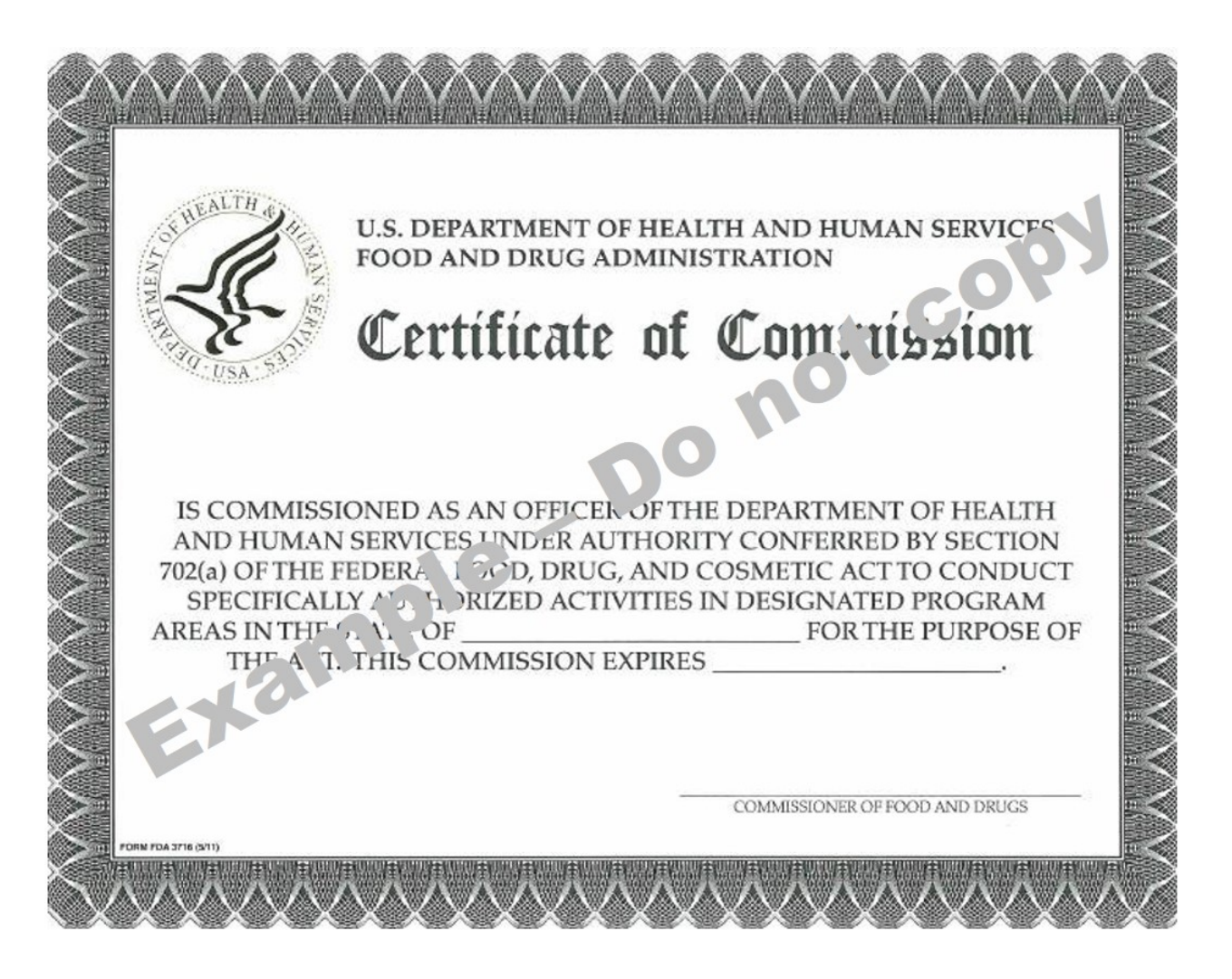
Exhibit 3-2: SAMPLE FORM FDA 3716: CERTIFICATE OF COMMISION