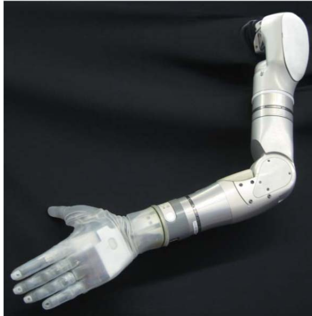
Figure 1 - DEKA Arm System

The DEKA Arm System is a lithium-ion battery operated upper limb prosthesis intended to restore limb functions in individuals who lost all (i.e., shoulder disarticulations) or part of either upper limb (e.g., trans-radial amputation).