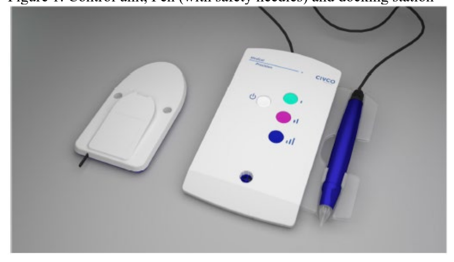
Figure 1: Control unit, Pen (with safety needles) and docking station