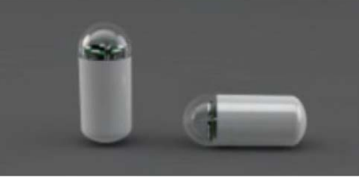
Figure 3-2: NaviCam Stomach Capsule

The NaviCam Stomach Capsule (AKEM-11SW) is an ingestible imaging device having an outer diameter of 12 mm and a total length of 28 mm. See image of the capsule below.