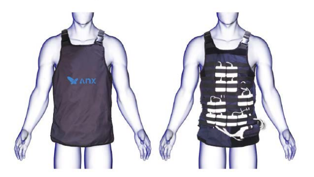
Figure 3-4: NaviCam Data Recorder in Examination Vest