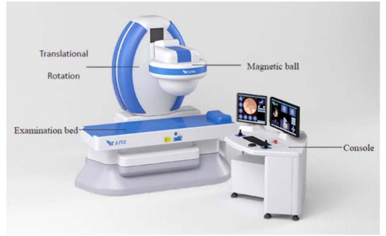
Figure 3-5: NaviCam Controller