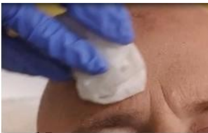
Figure 1A: Degreasing the skin

Before applying AMELUZ, carefully wipe all lesions with an ethanol or isopropanol-soaked cotton pad to ensure degreasing of the skin.