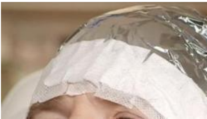
Figure 3: Occlusion

Cover the area where the gel has been applied with a light-blocking, occlusive dressing. Following 3 hours of occlusion, remove the dressing and wipe off any remaining gel.