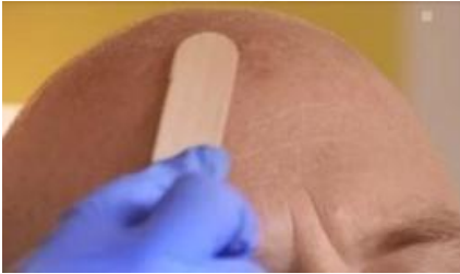
Figure 2: Drug application

Use glove protected fingertips or a spatula to apply AMELUZ. Apply gel approximately 1 mm thick and include approximately 5 mm of the surrounding skin. Use sufficient amount of gel to cover the single lesions or if multiple lesions, the entire area. Application area should not exceed 20 cm 2 and no more than 2 grams of AMELUZ (one tube) should be used at one time. The gel can be applied to healthy skin around the lesions. Avoid application near mucous membranes such as the eyes, nostrils, mouth, and ears (keep a distance of 1 cm from these areas). In case of accidental contact with these areas, thoroughly rinse with water. Allow the gel to dry for approximately 10 minutes before applying occlusive dressing.