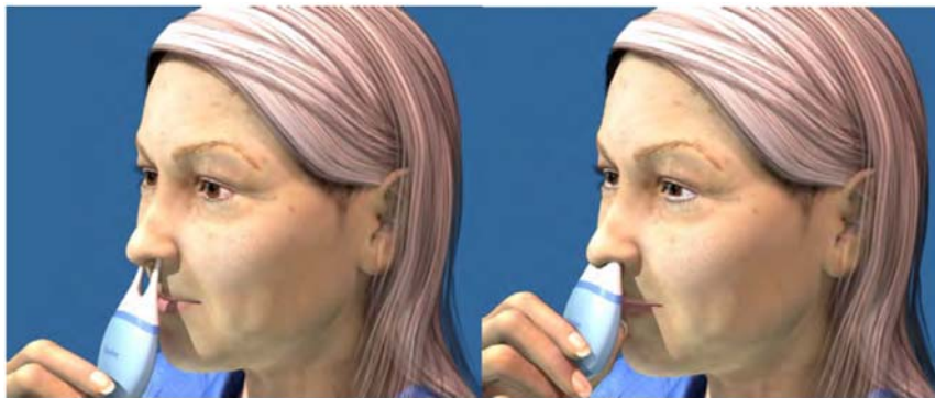
FIGURE 2. USE OF THE TRUETEAR INTRANASAL TEAR NEUROSTIMULATOR. (L) STARTING POSITION AND (R) CORRECT TREATMENT POSITION

Figure 2 is a schematic showing correct use of the device.