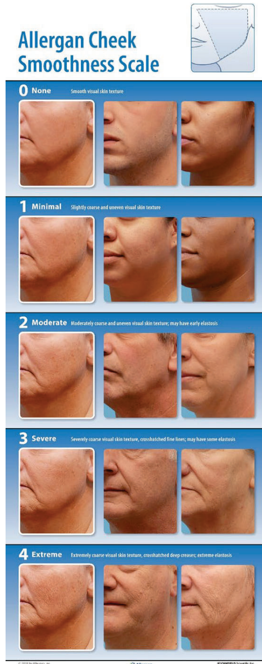
Figure 2: Allergan Cheek Smoothness Scale