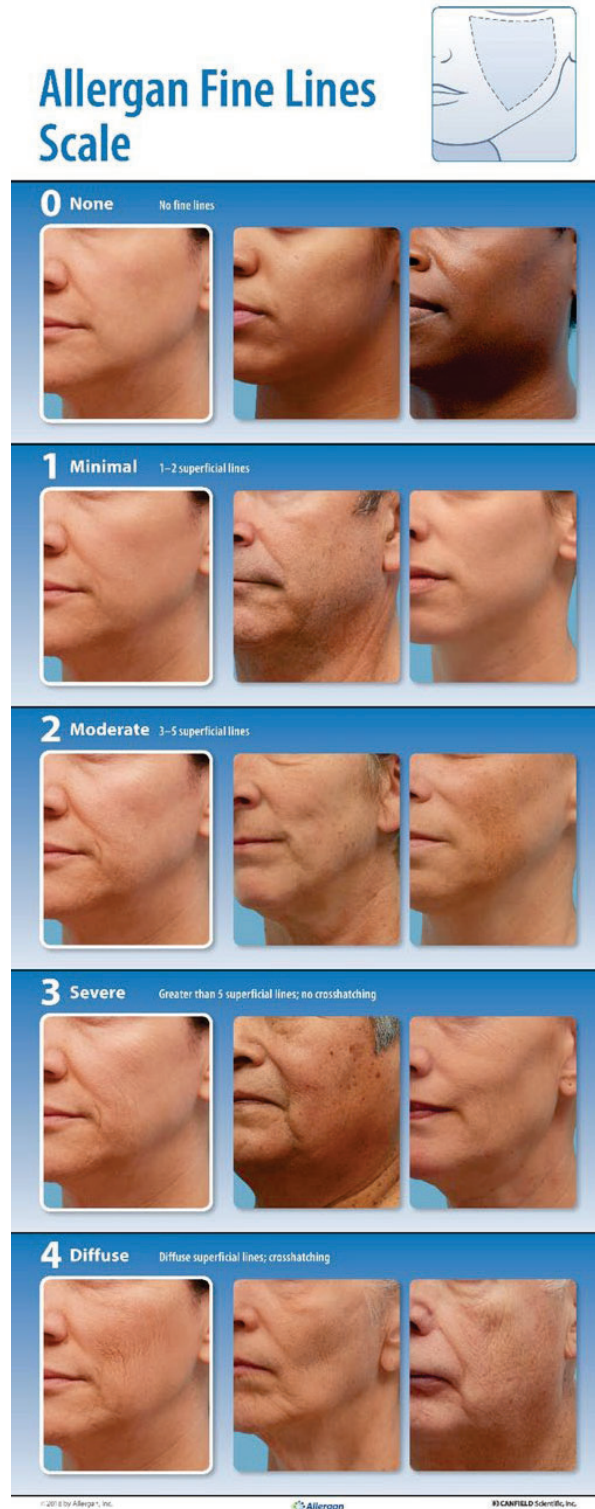
Figure 3: Allergan Fine Lines Scale