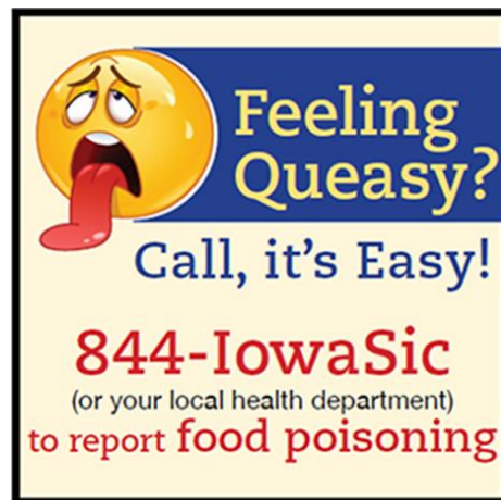
Figure 4: Iowa Food Protection Task Force's – "Feeling Queasy? – Call It's Easy!" campaign

The Washington D.C. task force presents the annual DC Health Director's Certificate of Merit Awards at its conference, recognizing DC Food Service establishments that do not exhibit any foodborne risk factors during routine inspections ( Figure 3 ). Of the 6,500 food establishments in D.C., only a select few achieve this high award each year. Food operations demonstrate food safety excellence by having no risk factor violations, priority, or priority foundation violations on their most recent health inspection report. They must also have a certified food protection manager on site at all times during operation and adhere to strict employee health and hygiene policies and practices. The establishments must be open for at least 18 months to qualify for the award and must have undergone inspection one or twice (depending on the business type) within the review period. Award winners vary from food trucks to specific chain restaurant locations, to large chain grocery stores, and even a government building snack bar.