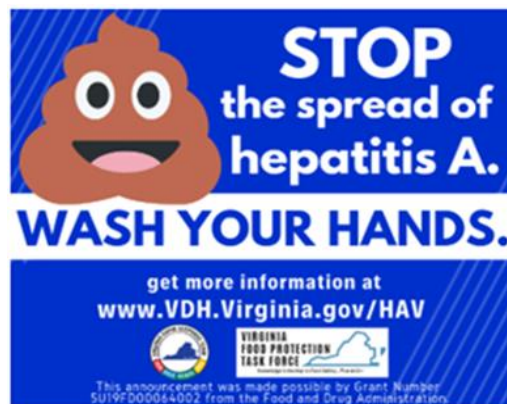
Figure 2: Virginia Department of Health Hepatitis A media image

The Coalition of Food Protection Task Forces and state food protection task force websites are web-based platforms that help share task force success stories from around the country. The following are a couple of examples: