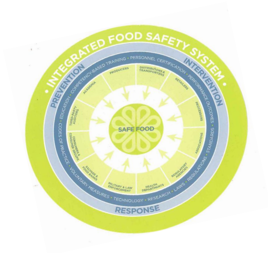
Figure 1: Integrated food safety system wheel

Active members of FPTFs may include representatives from federal, state, tribal, and local government agencies, commodity groups, food related trade associations, multiple sizes of food producers and retailers; hospitality, retailer, grocers', and food processor associations, academia, and others who collectively work together to identify and address food protection issues. Federal agencies may include regional and local FDA and USDA personnel. State and local entities may include the Departments of Agriculture, Education, and Health. Industry members may be as diverse as the regulated community within the state. The Integrated Food Safety System “wheel” (Figure 1) may provide some insight into the potential partners to consider when assembling a task force: