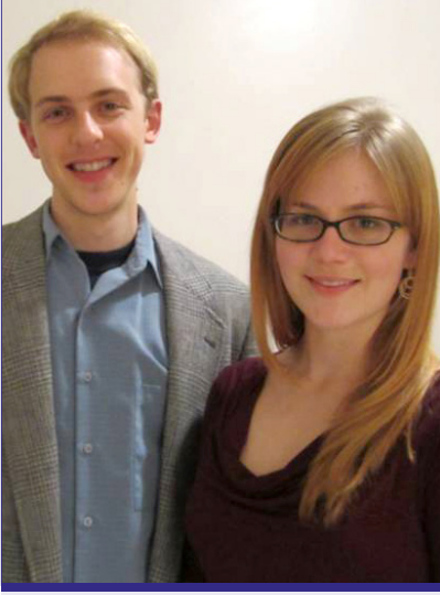
ABOVE • What does NIH stand for? These two scientist-songbirds say, Nerds in Harmony , of course. See story on p. 12.