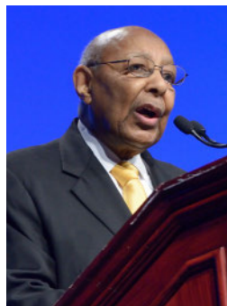
Former Rep. Louis Stokes

The summit boasted hundreds of speakers, unprecedented