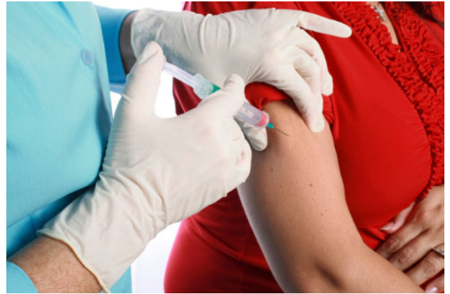
Norwegian pregnant women who received a vaccine against the 2009 H1N1 influenza virus showed no increased risk of pregnancy loss, while pregnant women who experienced influenza during pregnancy had an increased risk of miscarriages and stillbirths, a study has found.