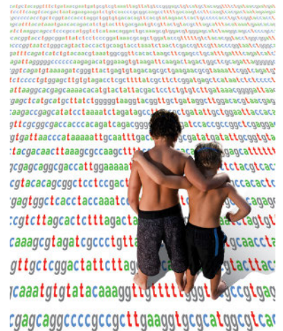
NHGRI plans several events to mark the 10-year anniversary of completion of the Human Genome Project.