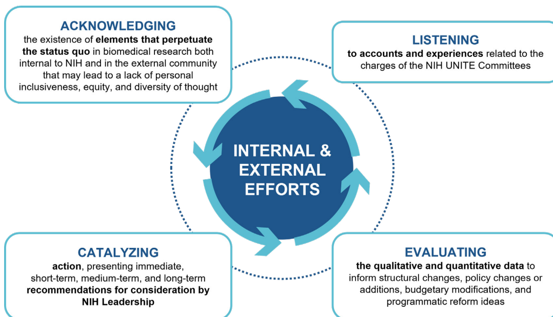
Figure 1: U Committee Framework