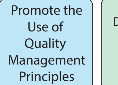
FIGURE 3: Overview of Proposed Health IT Priority Areas

Identify, Develop, and Adopt Standards and Best Practices